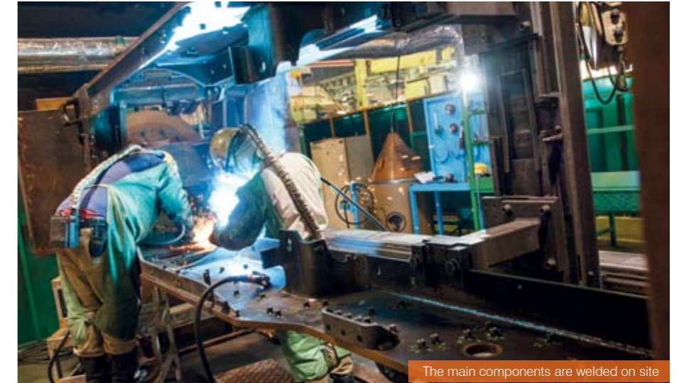
The main components are welded on site

The cab is then added to the increasingly recognisable structure, followed by the steps, fender and remaining covers. The penultimate stage encompasses the addition of the hydraulic oil and diesel, so that the engine can be switched on, and the movement of the lifting arm and bucket tested. Finally, the wheels, front fender and lights are the finishing touches to a new ZW-5 wheel loader.