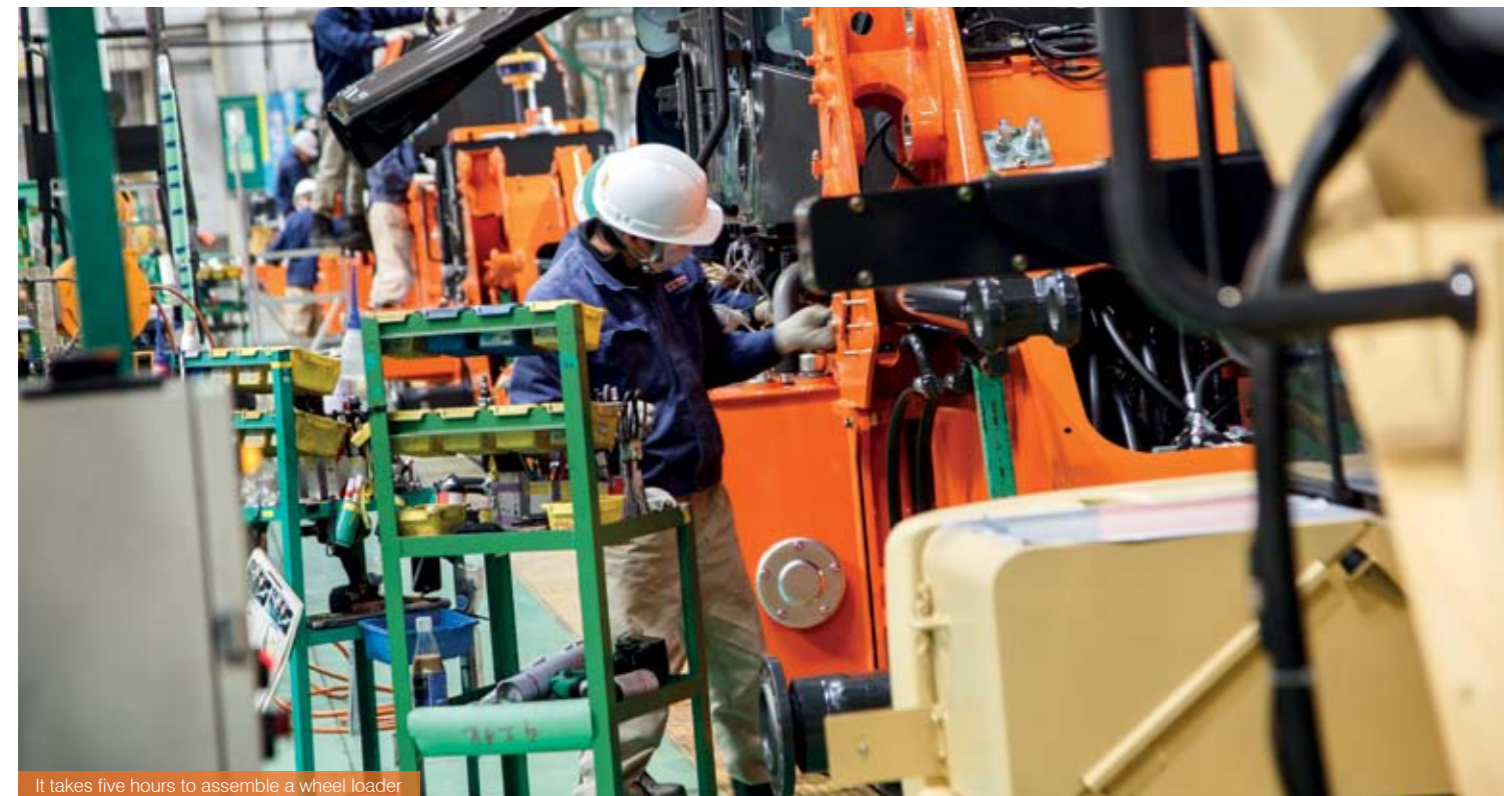
It takes five hours to assemble a wheel loader

This article was originally published in iGround Control , Hitachi Construction Machinery (Europe) NV.