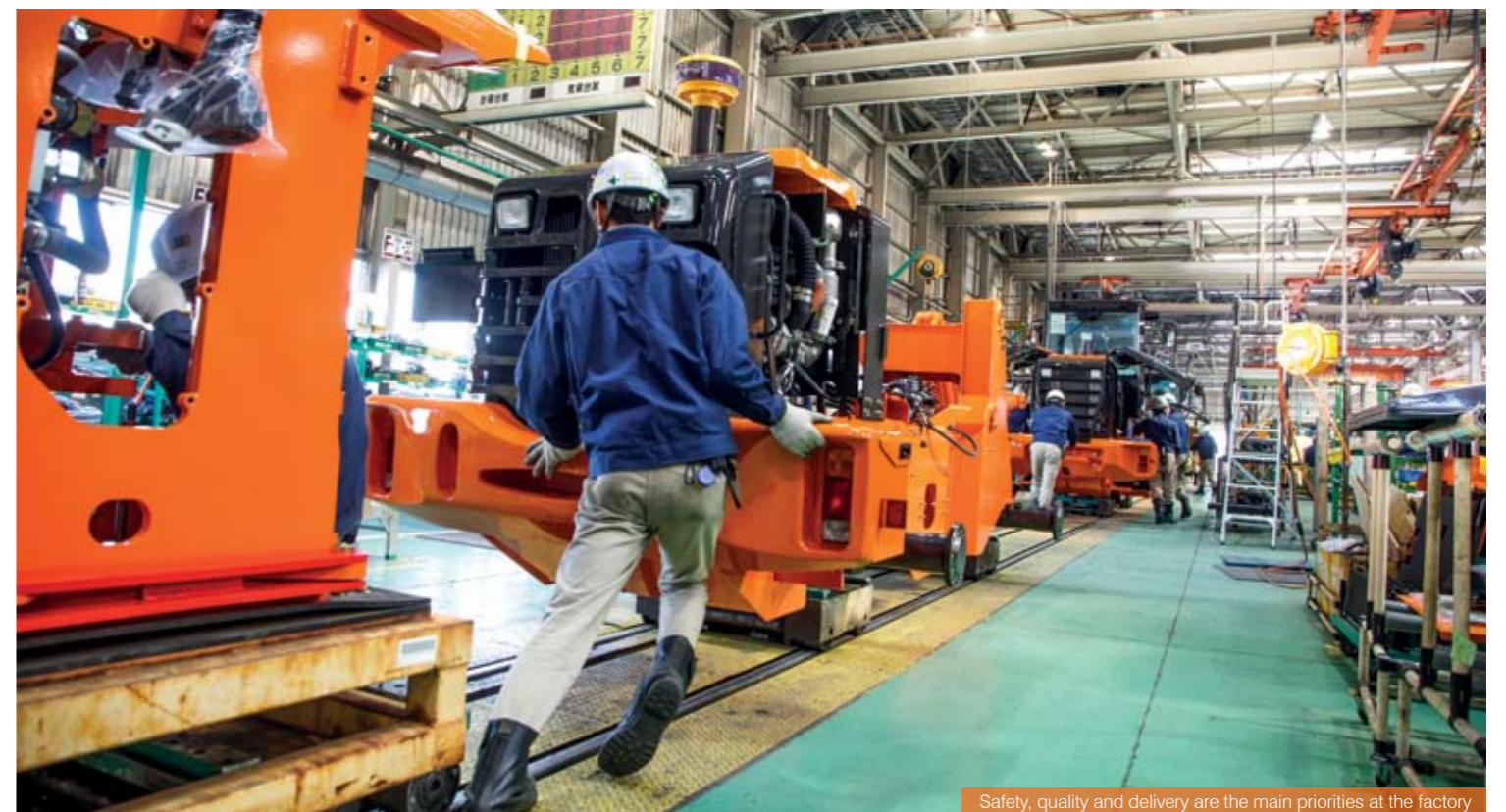
Safety, quality and delivery are the main priorities at the factory

With this in mind, Ryugasaki Works also features an interior rolling road and an extensive 720m test track for checking speed, braking and handling. This is routed around the periphery of the site and includes a steep uphill section.