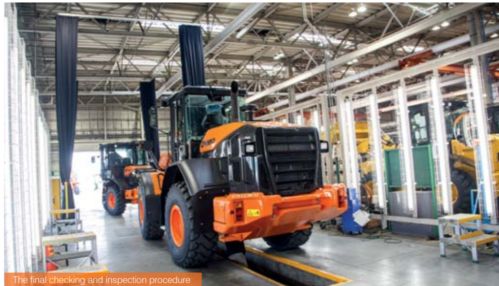
The final checking and inspection procedure

To achieve this, the ZW220HYB-5's four-cylinder engine powers a generator, which produces energy to drive two electric travel motors. When the machine is rolling or braking, it continues to store electricity in a capacitor. Under acceleration, it uses energy by the generator and the capacitor, and so less revs are required when it reaches normal travel speed.