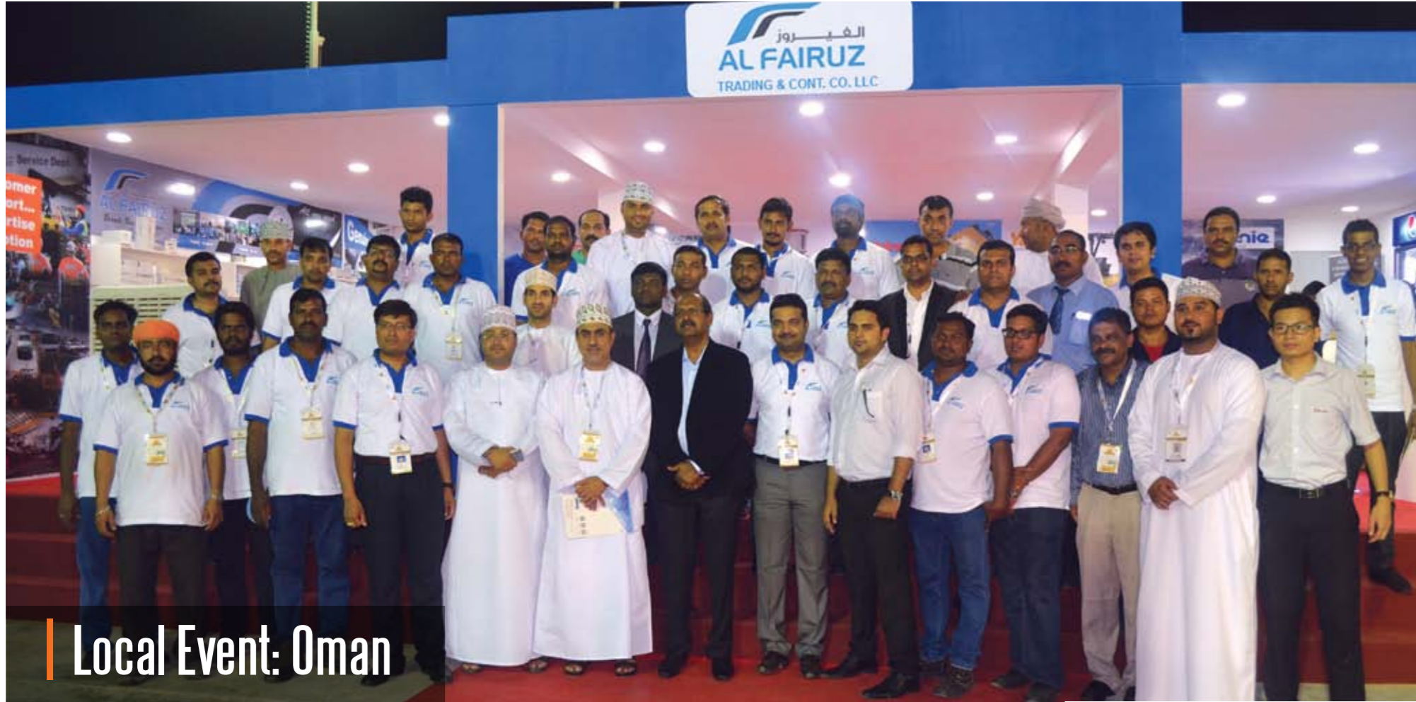
Local Event: Oman