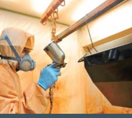
The warehouse is equipped to handle parts coating

Earthmoving Middle East North East Africa