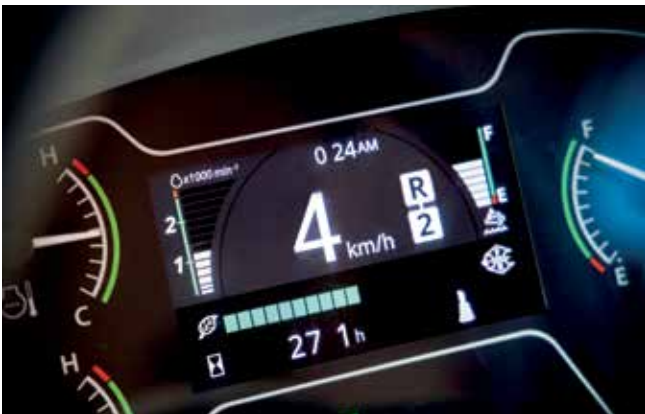
The ECO gauge helps to deliver better fuel consumption.