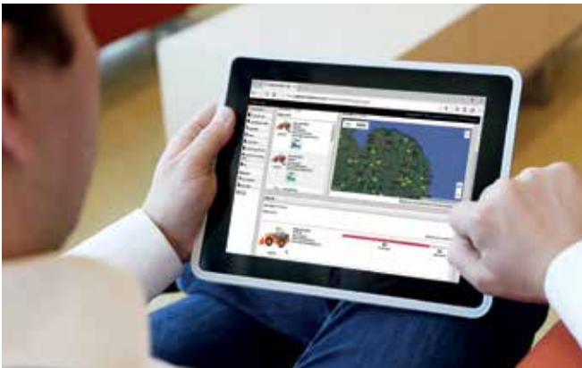
A wide range of data on Global e-Service enhances efficiency.