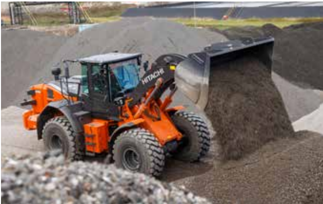
Monitoring the performance of your wheel loader ensures exceptional reliability.