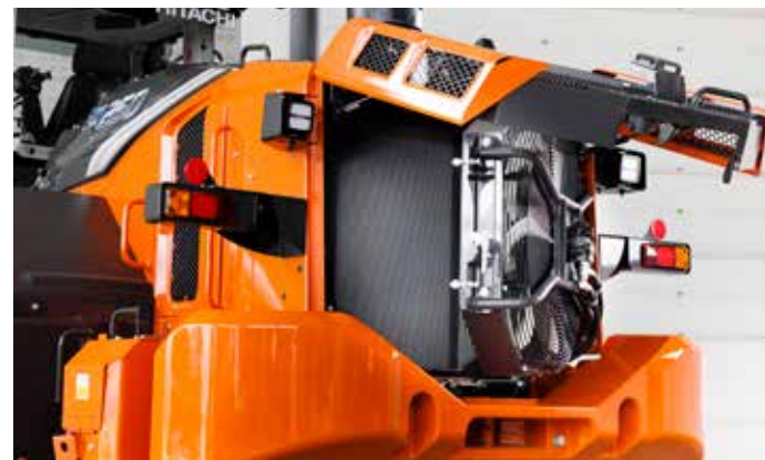
Intelligent fan operation system prevents radiators clogging.