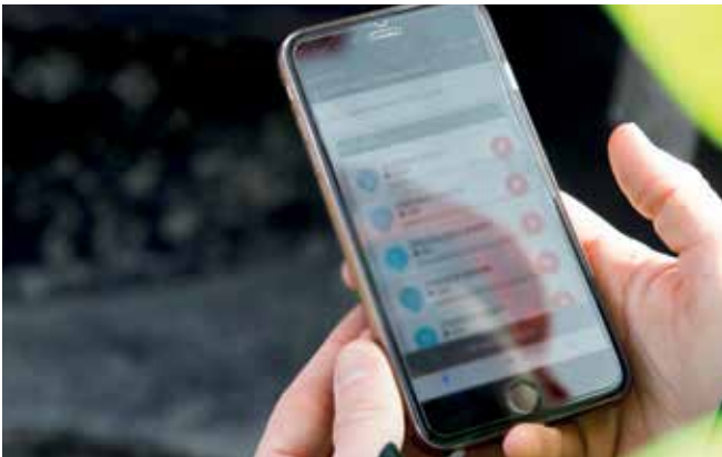
The alerts on the ConSite Pocket App provide real-time information.

The ConSite Pocket App sends you real-time alerts for issues arising with your machine. You'll receive recommendations on what to do and step-by-step help guides. The app also enables you to see the location of your fleet.