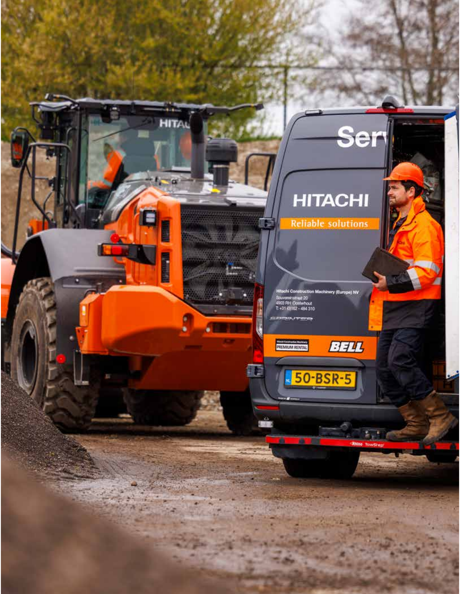
Hitachi Construction Machinery provides the highest level of technical support.