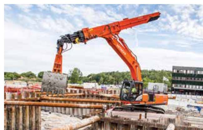
Special application excavators