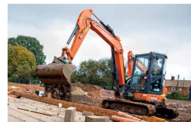
Zaxis mini excavators