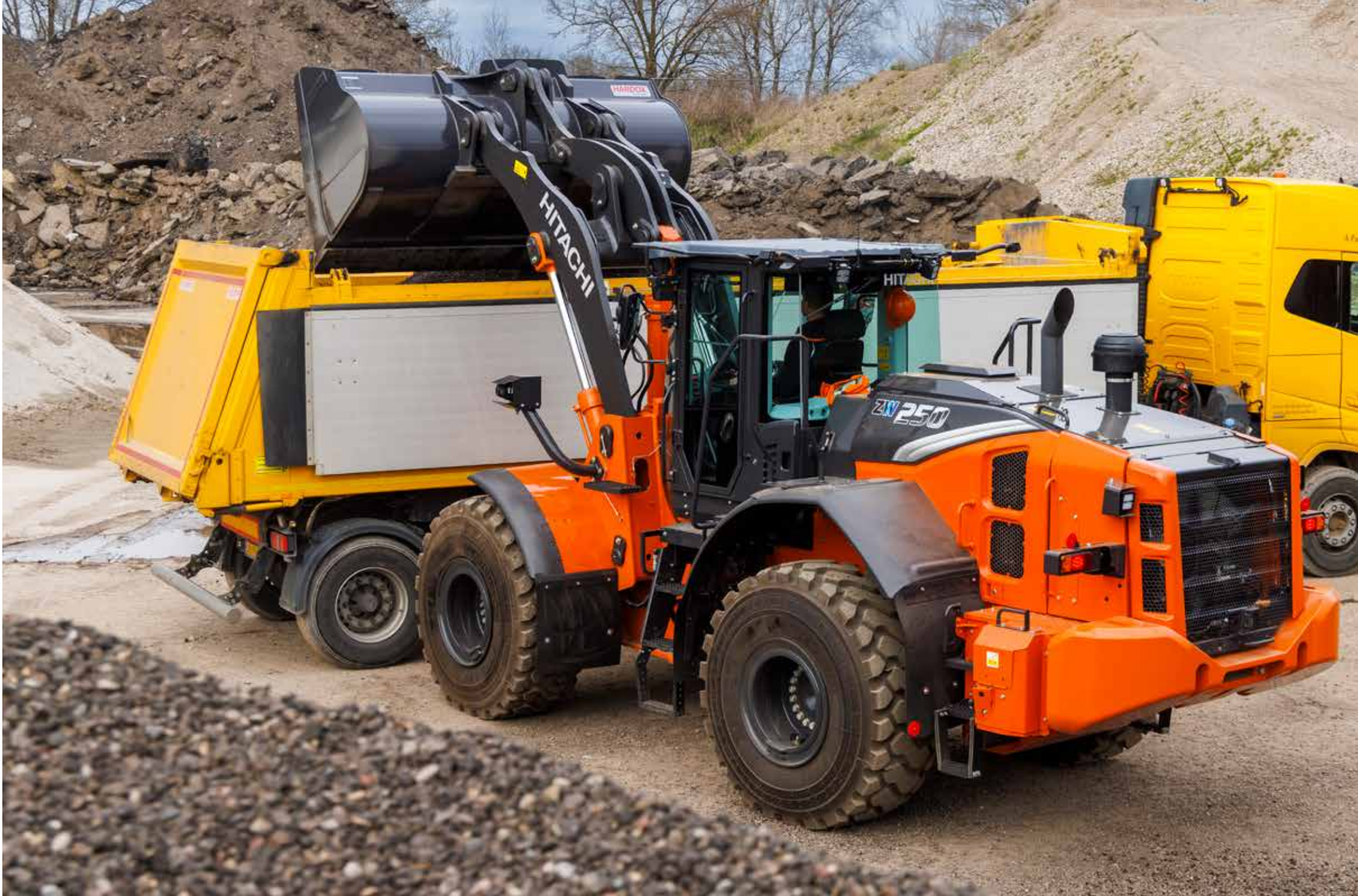
Impressive fuel economy and exceptional efficiency of the ZW250-7 increase profitability.

Your operators can also work more productively and accurately thanks to the payload checker. This enables them to keep track of load weights in real time on the monitor and find out how much material is in the bucket or truck. The display shows when the bucket or truck is overloaded, so you can adjust the final load to achieve target capacity.