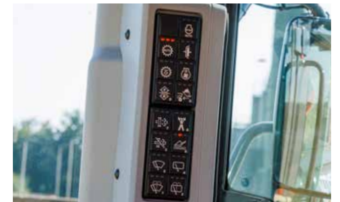
All commonly used functions can be selected at a glance using the side panel switch.