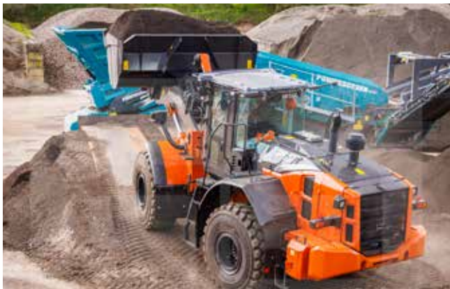
Approach speed control maximises efficiency.