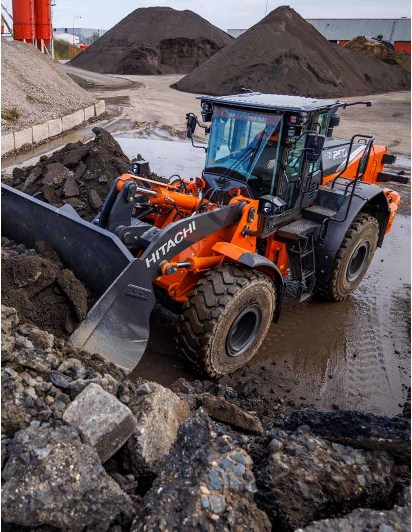
ZW-7 wheel loaders are tested rigorously to ensure high levels of durability.