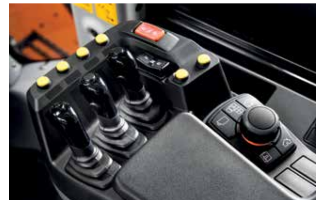
Operation is easy with ergonomically designed controls and switches.