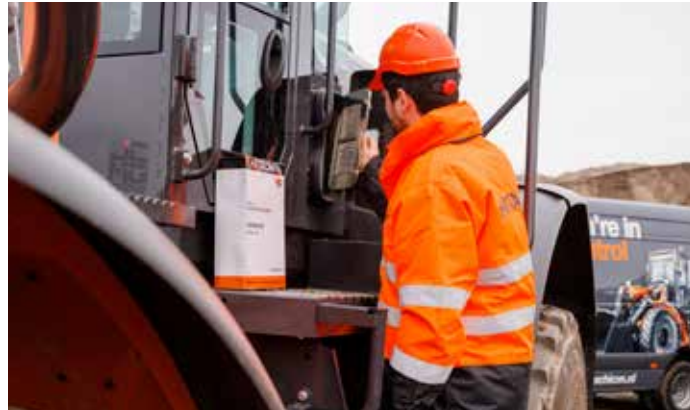
Minimise downtime with Hitachi Genuine Parts.