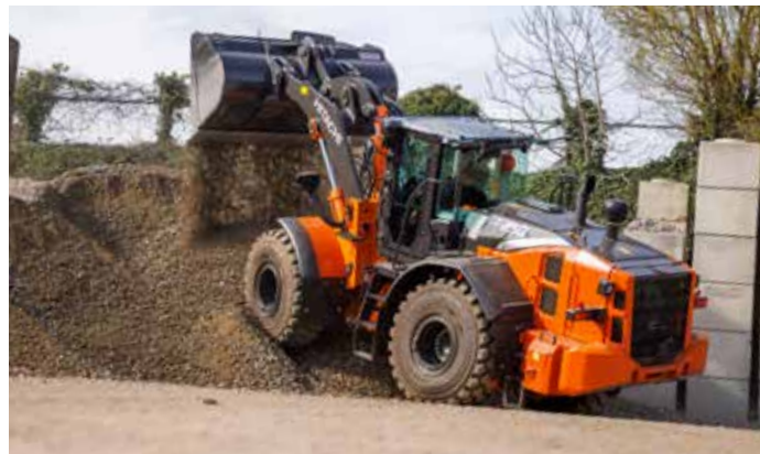
Hitachi Premium Rental enables you to pay as you earn.