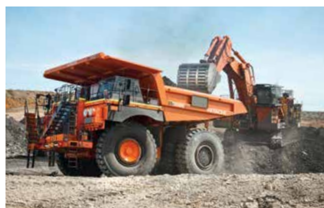
EH dump trucks and EX ultra-large excavators

Whatever vision you wish to create, Hitachi Construction Machinery has the product, people, solutions and services you need to make it become a reality – and empower you to take control of your world.