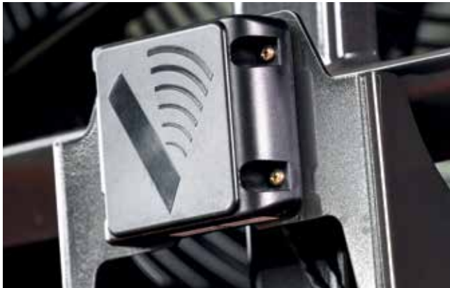
Rear obstacle detection system enhances safety on the job site.