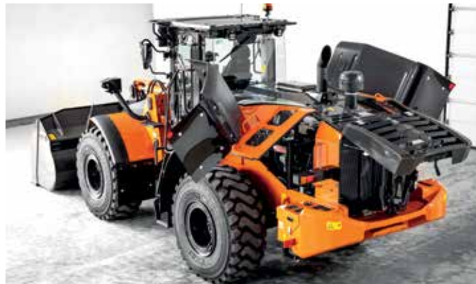
Engine cover enables convenient access for daily inspections.