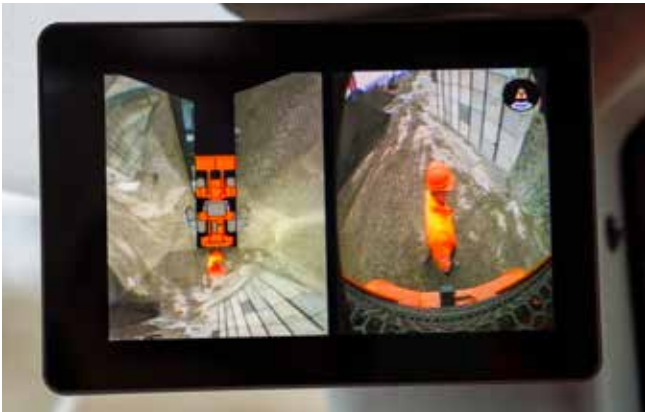
Choose between different image layouts to suit your working environment.