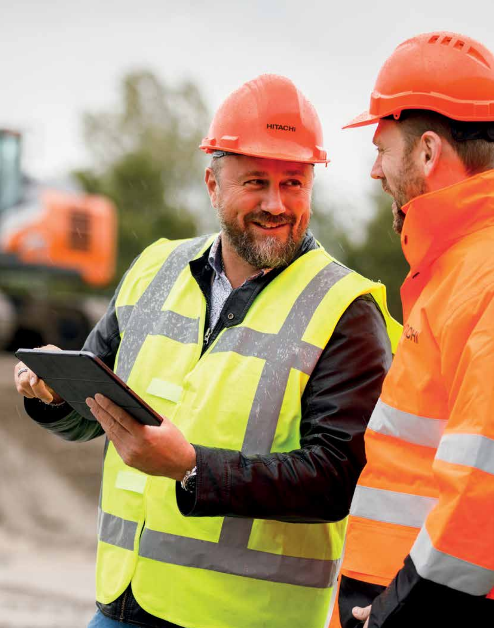
Hitachi Construction Machinery offers a wide range of after-sales services for planning maintenance and managing running costs.