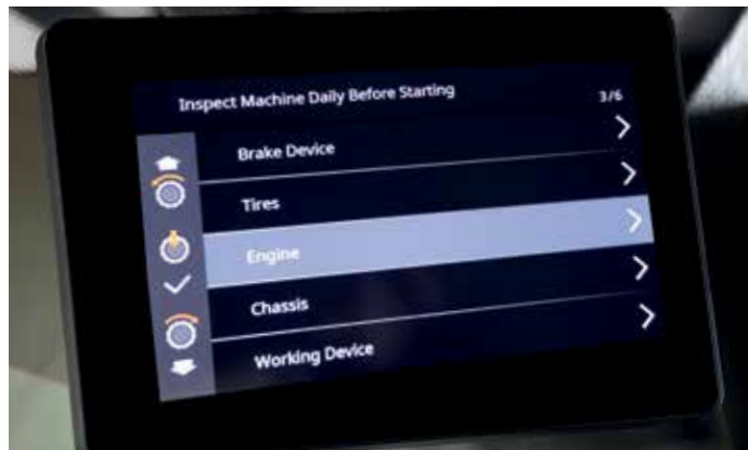
Daily inspection reminders make life easier for operators.