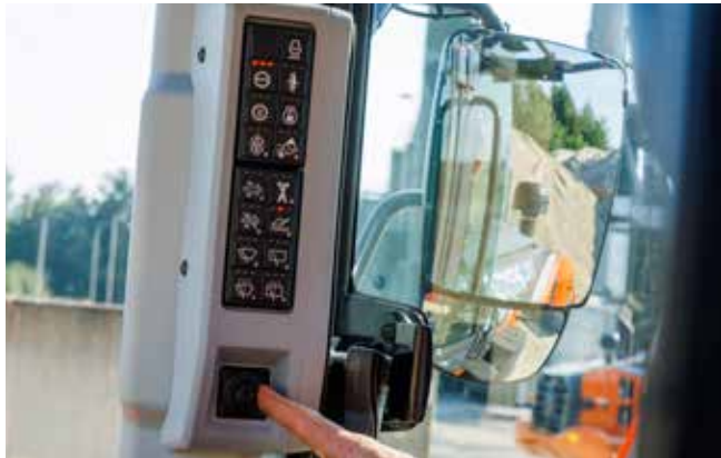
Electrically adjusted mirrors provide a clear rear view.