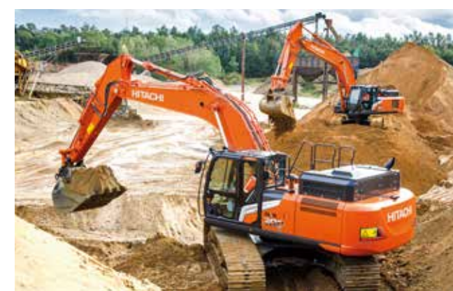
Zaxis medium excavators