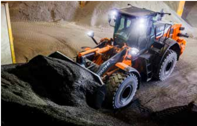
LED work lights improve visibility in challenging conditions.