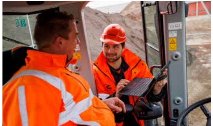
HELP extended warranties and service contracts provide optimal performance.