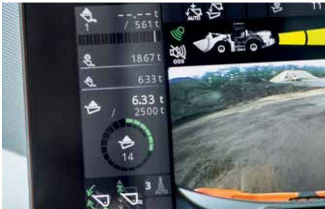
Work more productively and accurately using the payload checker.