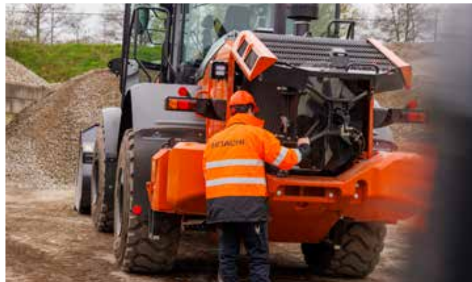
Easy maintenance features minimise downtime.