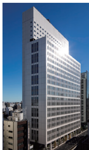
Ueno East Tower