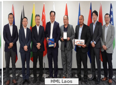
Appreciation Ceremony with valued dealers.