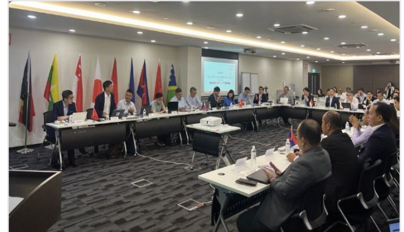
Dealers Conference @ HMAP

Hitachi Construction Machinery Asia and Pacific (HMAP) hosted its first-ever Dealers' Conference FY2024 on 13th March 2025 at main office Singapore, bringing together the dealers from across Southeast Asia. The event aimed to provide valuable insights into the latest products and services, explore new growth opportunities, and foster strategic partnerships for enhanced collaboration and dealer success.