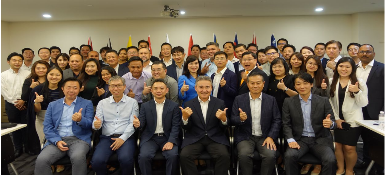
Group photo with all participants

The event proved to be a great success, fostering a stronger sense of community and partnership among HMAP and dealers. Moving forward, HMAP is committed to continuing its collaborative efforts to drive growth and innovation within the industry