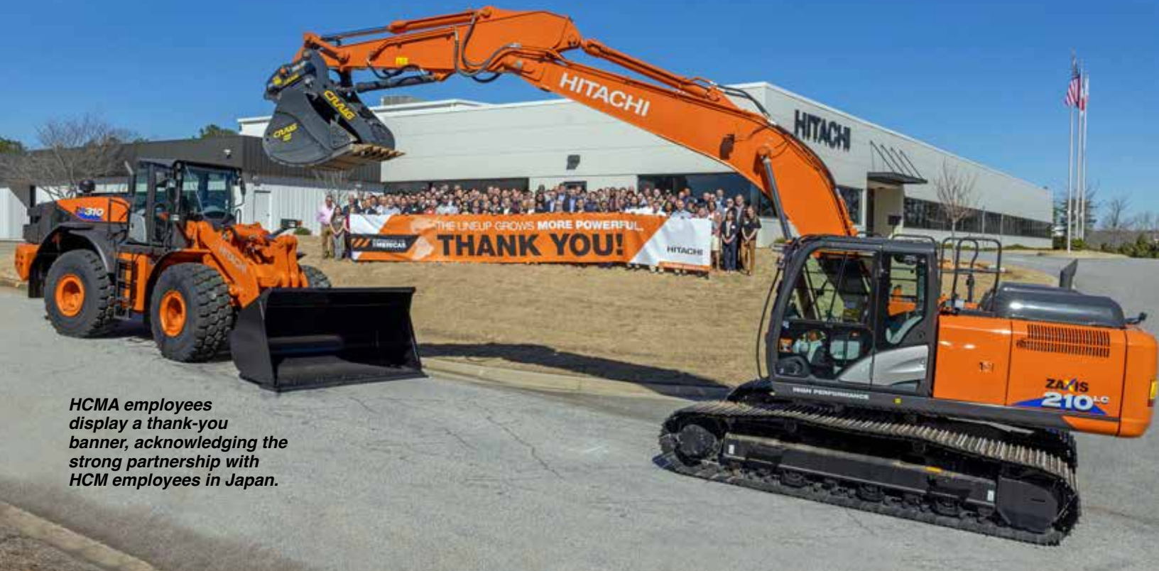
HCMA employees display a thank-you banner, acknowledging the strong partnership with HCM employees in Japan.