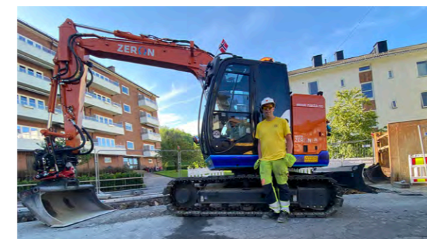
Norway, the country that has made the biggest move to EVs, has strong requirements for electrification on worksites as well.

Under the framework of the Paris Agreement with the aim of achieving carbon neutrality by 2050, the EU and other European countries are pushing investment promotion policies aimed at decarbonization. For example, Norway is seeing a more rapid increase in demand for electric construction machinery than in other countries because of a wide range of incentives, such as a 40% subsidy covering the price difference with a standard engine-powered model. Also, Germany has introduced a financial aid program aimed at promoting investment towards reducing carbon emissions, and the Netherlands is also considering a subsidy program for the purchase of electric construction machinery. Major European cities are also increasing numbers of low- and zero-emissions zones, and numbers of gasoline-powered vehicles are gradually decreasing. In view of this, customers in European countries are showing an ever-increasing interest in electric construction machinery.