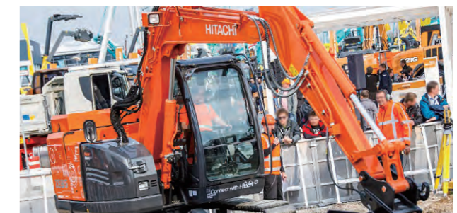
Demonstration of ZE85 exhibited at international construction machinery trade fair

In fiscal 2020, the ZE85 was selected for a zero emissions construction site pilot project in Norway's capital Oslo. This test project using only electric construction machinery was carried out in an area in front of Oslo's city hall. The test showed that power and operating duration performance of the ZE85 were comparable to engine-powered models, and these have been introduced on zero-emissions worksites. Moving forward, Hitachi Construction Machinery will continue to seize such opportunities to meet the needs of Europe which has high environmental standards and strict regulations.